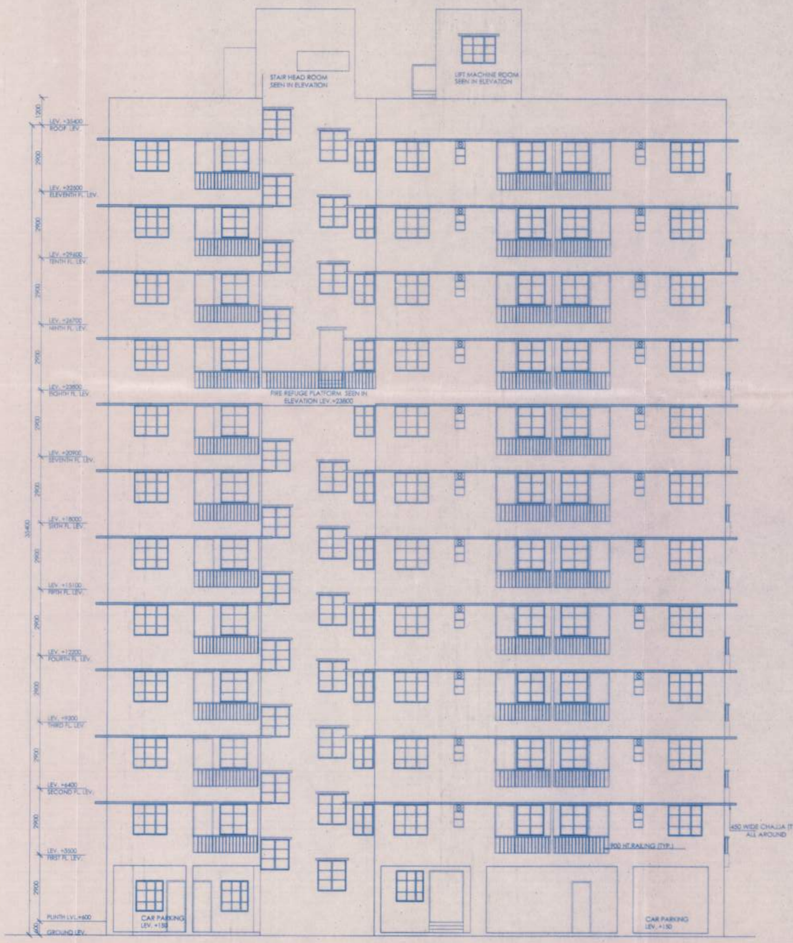
FRONT ELEVATION (NORTH-WEST SIDE)